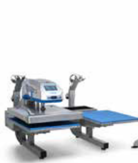
DUAL AIR FUSION®