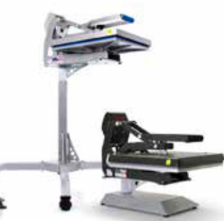
CLAM ON HEAT PRESS CADDIE™