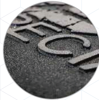
High density labels & logos for t-shirts/shirts