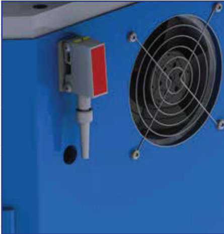
Cloth detector sensor avoids printing on empty pallet and damaging screens