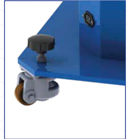
Ultra-mobile design with castor wheels