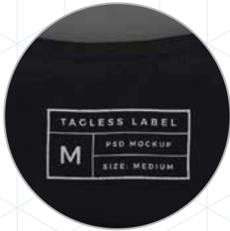
Tagless neck label