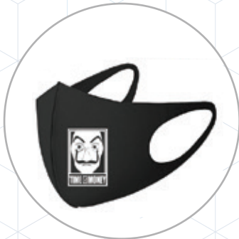
MASK & SURGICAL GLOVES