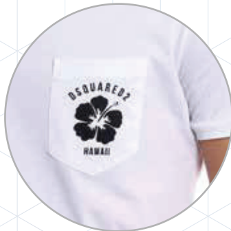
Pocket/shoulder logo printing