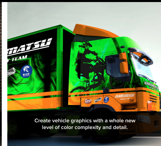
Create vehicle graphics with a whole new level of color complexity and detail.