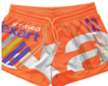
Orange and violet for vivid printing. Black ink for details and opacity. Light cyan and light magenta for smooth gradations.

The XT-640 offers exceptional media tracking to prevent alignment errors during production. An advanced vacuum system keeps transfer paper flat for printing, while a convenient new feed adjuster and take-up system prevent media skewing and ensures a correctly wound roll for smooth transition to the heat transfer process.