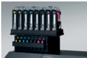
Roland Ink System.

With its rugged construction and dual print heads in a staggered formation, the XT-640 is built to meet the demanding production requirements of the textile industry, providing machine stability as well as impressive graphic output and high-speed performance. To capture every gradation and detail, each of the eight-channel print heads fire precise droplets in up to seven different dot sizes to accommodate media characteristics and desired image brightness and sharpness.