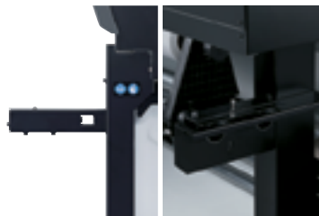
Feed Adjuster at front. Adjustable media holder at rear

The XT-640 features a bulk ink system with one-liter pouches, to ensure uninterrupted printing on long print runs. The ingenious Roland Ink Switching System automatically switches to a backup pouch when the primary pouch runs out – meaning you don't have to stop the printer to replace inks. And while you're away from the printer, the Roland Printer Assist iPad app allows remote management of common printer functions.