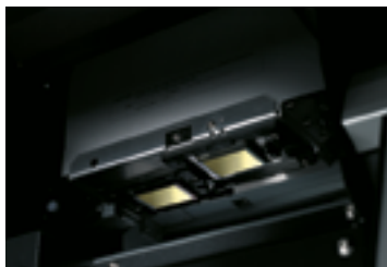
Dual print heads in staggered formation.